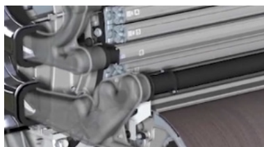
Doffer suction system