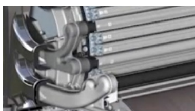
No Doffer suction