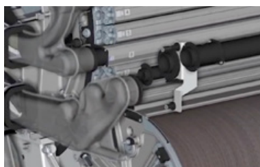
Quick & easy retrofit